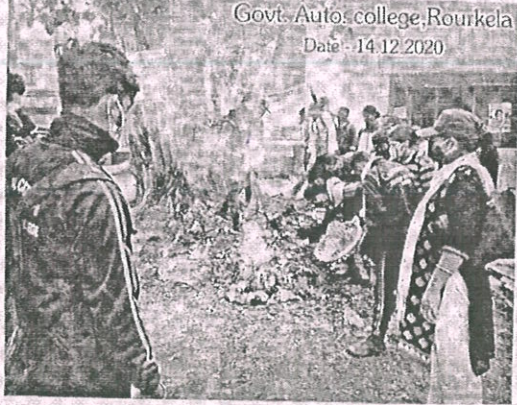
Govt. Auto. college, Rourkela Date - 14.12.2020