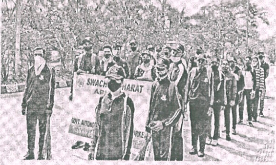
Govt. Auto. college, Rourkela Date - 14.12.2020